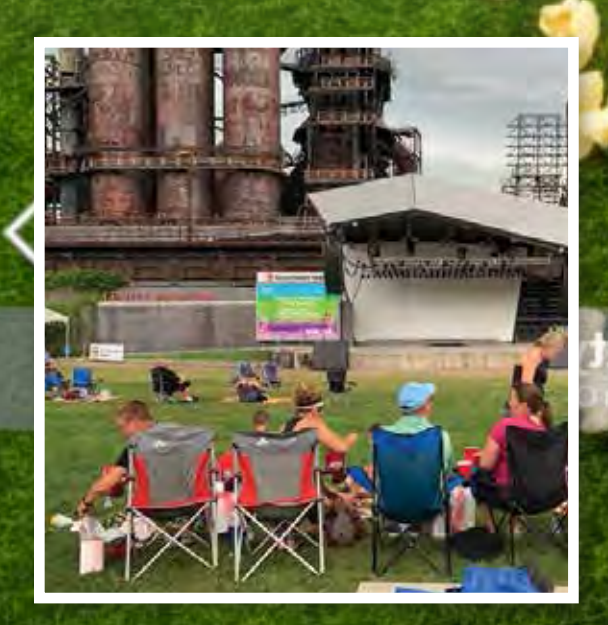
Invited guests settle in for the movie to begin.