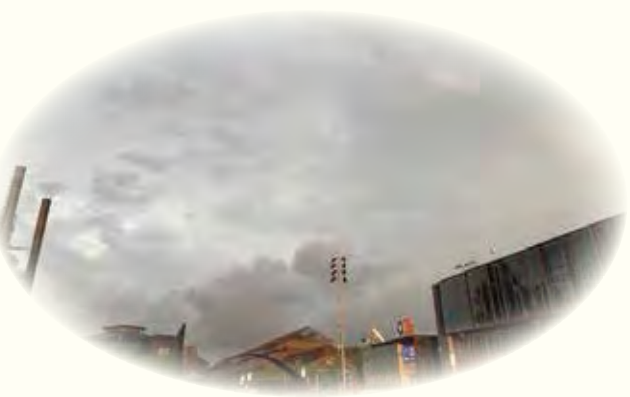
Dark clouds threatened, but the rainbow peeking through was a promising sign!

A pre-movie storm discouraged some folks but eventually the skies settled and the show went on!