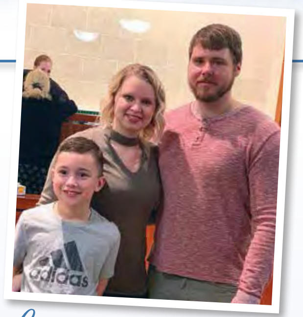
on March 5, 2019.