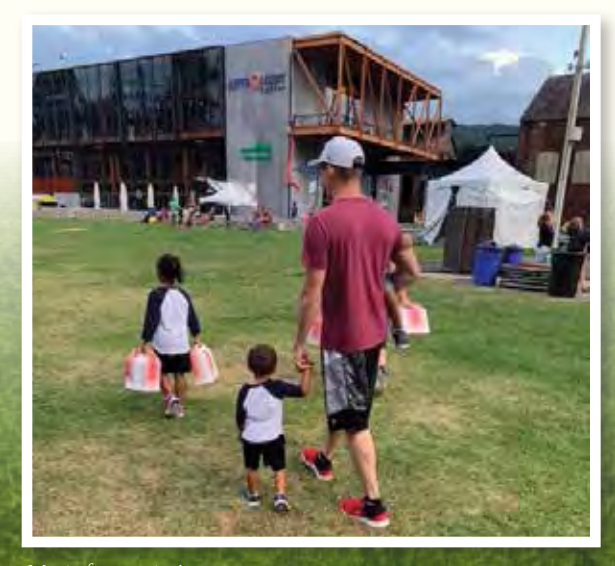
Movie fans arrive!